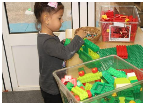
Focusing on designing a construction with Duplo (M,EAD)

Autumn and warm clothing Please ensure your child has a warm coat for the garden as the temperatures start to drop. We do enable children to play outside in all weathers, as there are so many learning opportunities created by wind, rain, sunshine, rainbows and other experiences. Make sure you have a spare set of clothes in a bag for your child too, just in case they get a bit wet or messy through their play - indoors or outdoors! There are nursery wellies available, or you may prefer to send in your child's own pair (make sure they are named). Thank you for helping with this.