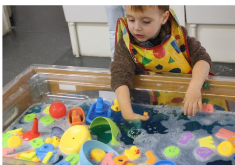
Exploring properties of water in back class (M,UW)