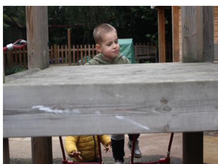
Having an adventure on the rope climb(PD)