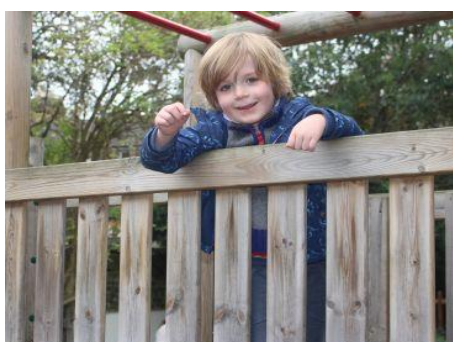
Observes sycamore keys floating from the climbing frame to the ground (UW)

Play and Learning opportunities We know that children learn best by following their own interests, supported by knowledgeable, well-informed adults. So the environment is set up to support this. Here are some examples of what we have seen in the first half term.